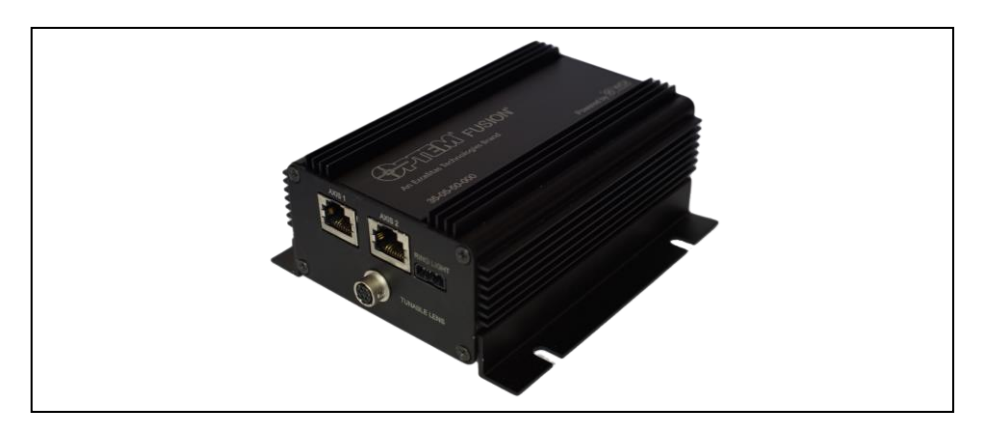
Optem® FUSION system controller provides simplified automation across the full FUSION micro-inspection platform

The Optem<sup>®</sup> FUSION system controller provides seamless integration and control across the entire Optem<sup>®</sup> FUSION micro-inspection platform. The intuitive plug and play controller brings simplified system-level automation to the field proven modular FUSION system.