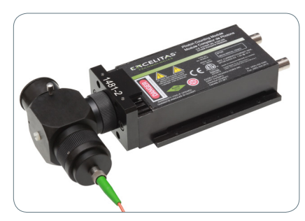
Application example of the SPCM Connector Kit TC (Fiber and SPCM with bracket not included)