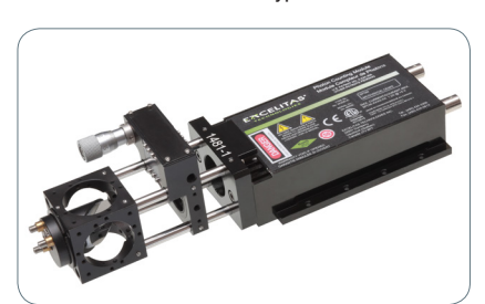
Application example of the SPCM Connector Kit MB (SPCM with bracket not included)