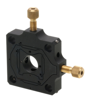
fle.X-plate XY Diff