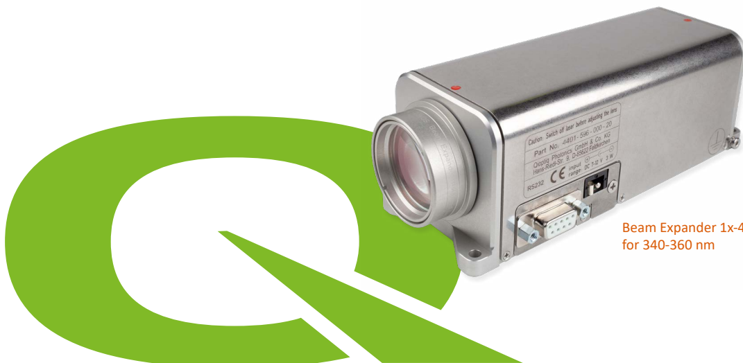
Beam Expander 1x-4x for 340-360 nm